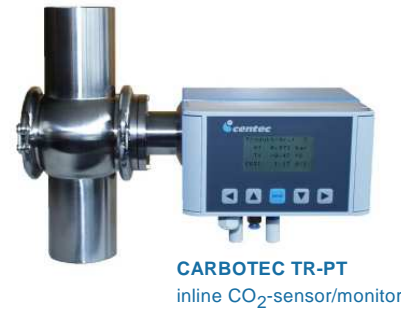
CARBOTEC TR-PT inline CO 2 -sensor/monitor