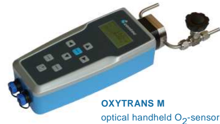
OXYTRANS M optical handheld O 2 -sensor